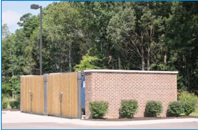
A combination of building materials and landscaping effectively screen a dumpster pad.

The quality of the Technology Corridor as viewed from public rights-of-way is very important to the image of the Corridor. Service and maintenance areas, because of their propensity to become nuisances, are to be screened from view.