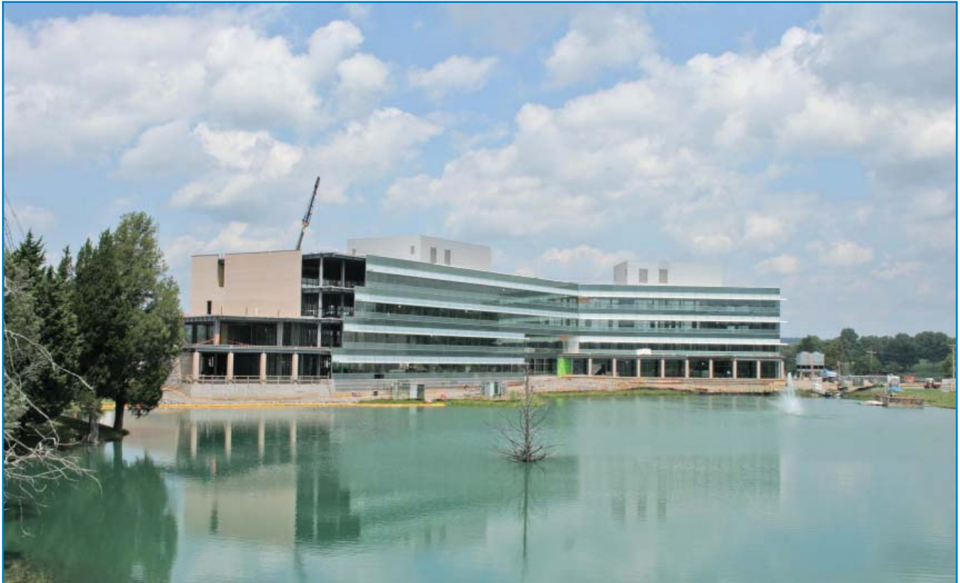
The Scripps Networks office expansion has been designed to be eligible for consideration of LEED certification.

Developers and property owners are encouraged to submit proposals that comply with LEED (Leadership in Energy and Environmental Design) Certification requirements, as established by the U. S. Green Building Council. In such cases, the TTCDA Board may consider waivers to the Design Guidelines, where the guidelines are in conflict with LEED requirements and standards. To be eligible for such waivers, the applicant shall submit a written justification explaining the need for the waiver and how the specific LEED requirement is in conflict with the corresponding requirement of the Design Guidelines.