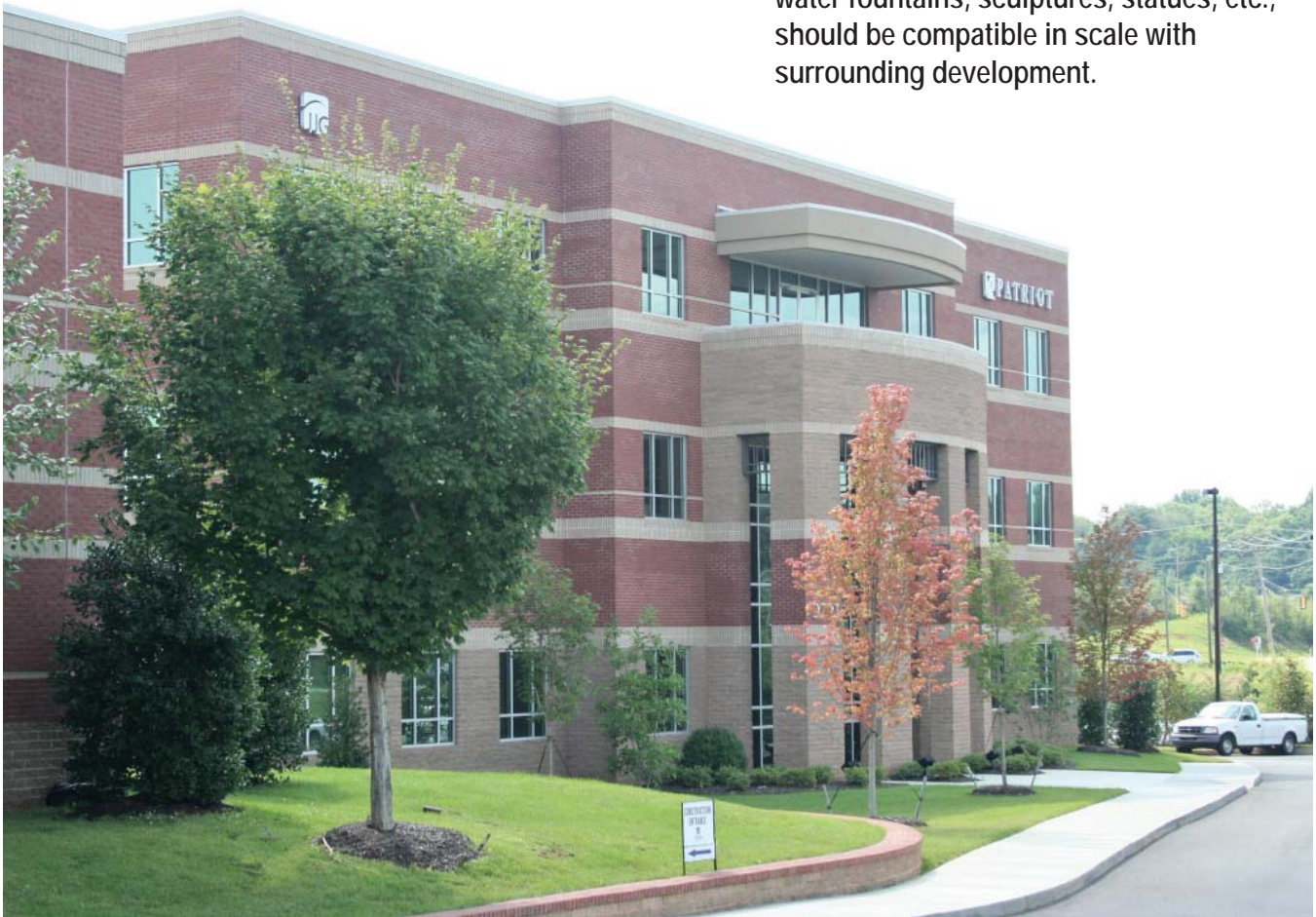
A combination of architectural elements creates visual interest in this building's exterior.