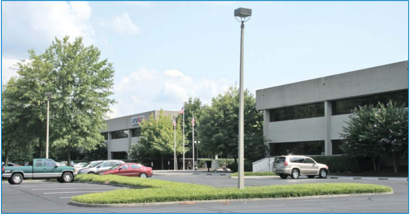
Another early Technology Corridor development, Pellissippi Office Center, provides a good corporate image to motorists passing by on the Pellissippi Parkway.