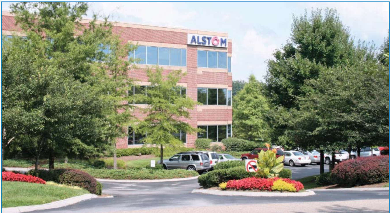
One of the earliest Technology Corridor projects, Center Pointe Business Park is an example of a well-designed complex of offices and technology-based businesses.